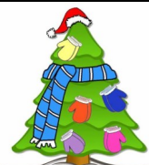
Mitten Tree Day